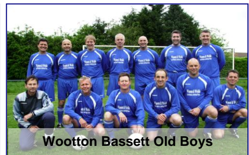
Wootton Bassett Old Boys