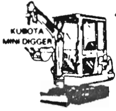
KUBOTA MINI DIGGER