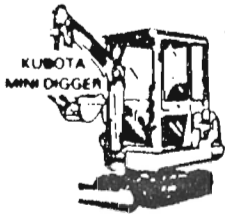
KUBOTA MINI DIGGER