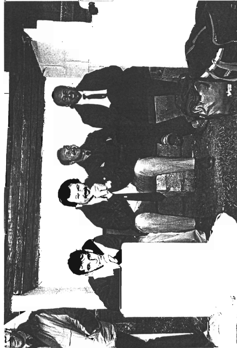
Management in a happier mood - we must have been winning!!!

UNIT 4 TEMPLARS WAY INDUSTRIAL ESTATE WOOTTON BASSETT NR. SWINDON WILTS. SN4 7EN TEL: 0793 454674 (DAY) 617354 (EVE)