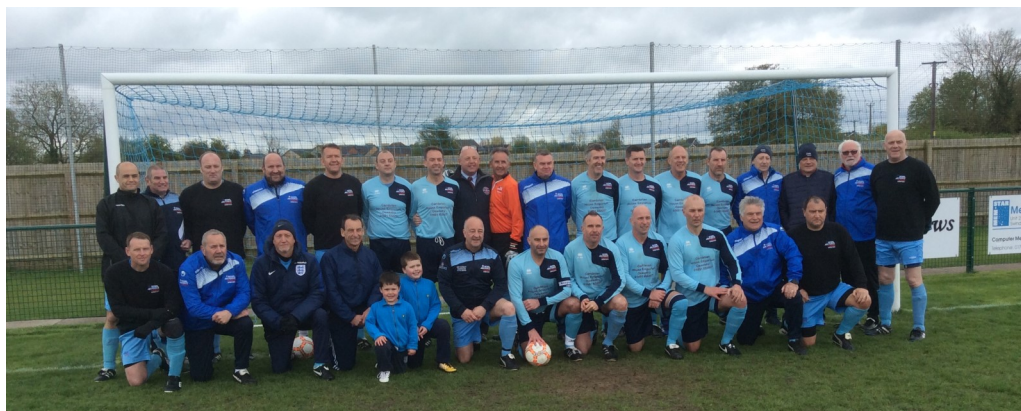
The RAF squad pictured before the game at the GBSG in April 2018