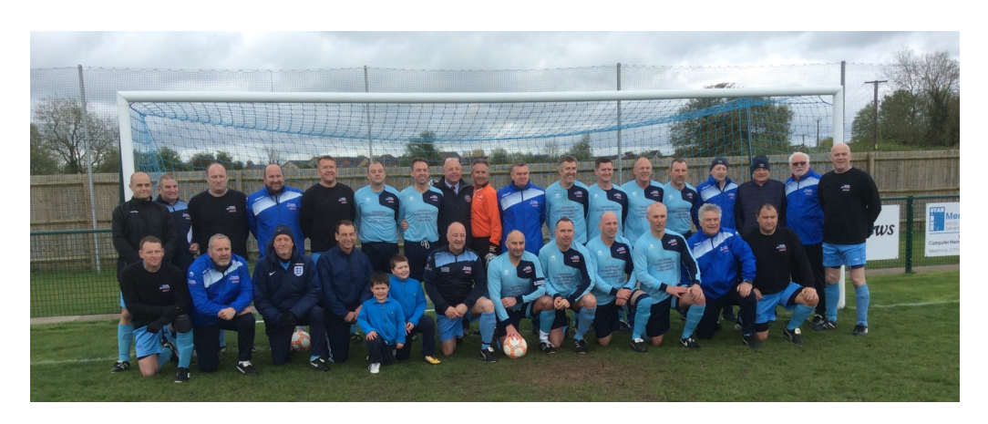
The RAF squad pictured before the game at the GBSG in April 2018