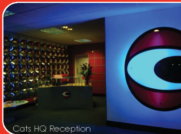
Cats HQ Reception

COLOUR DIGITAL COLOUR DIGITAL COLOUR DIGITAL COLOUR B&W COPYING B&W COPYING B&W COPYING B&W C 24x7 PRINT 24x7 PRINT 24x7 PRINT 24x7 PRINT ONLINE WEB ORDERING ONLINE DIGITAL SOLUTIONS DIGITAL SOLUT 24x7 SERVICE 24x7 SERVICE 24x7 SERVICE WE SELL XEROX COPIERS & PRINTERS WE S